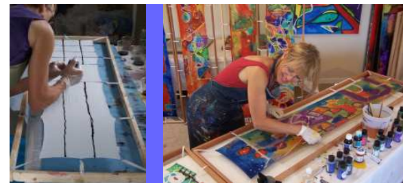
Art, Courage & Creativity THE SILK WORKSHOP

This longer ACC session introduces new mixed media and activities designed to help novices and experienced artists alike, relax, revive and reinvent themselves. While there is ample oil