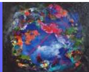
Art, Courage & Creativity II — TAKING IT FURTHER

DATES: Thursdays, Dec. 1 through Dec. 29 LOCATION: Victoria Monize Fine Art Gallery TIME: 2:00 to 5:00 pm COST: $65 each or $260 (20% off) for Series