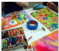
Art, Courage & Creativity I THE FIRST WORKSHOP

"Art, Courage & Creativity" is for adults who want to express themselves artistically, but who feel unsure of their natural abilities. We use oil pastels and paper to identify and overcome the inhibitions that limit us, in a playful and relaxed setting. All materials are provided. All you need is an apron or old clothes. This is a brief, fun hands-on opportunity to explore your feelings through color, and to see how that experience can enrich other aspects of your life.