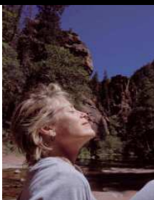
Art, Courage & Creativity SELF INQUIRY NEW

Contact Karen Leeds / Reservations & Details: art@karenleeds.com 602-321-0219